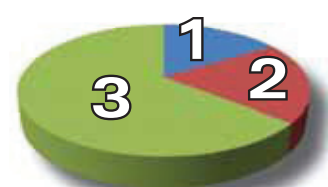
Public Safety and Transit Projects